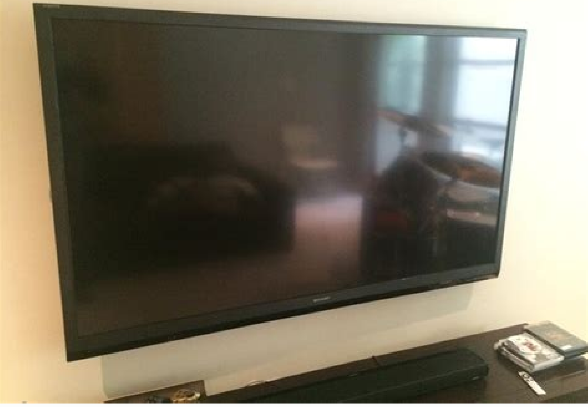
Sharp 70 class aquos 4k ultra hd smart tv manual.