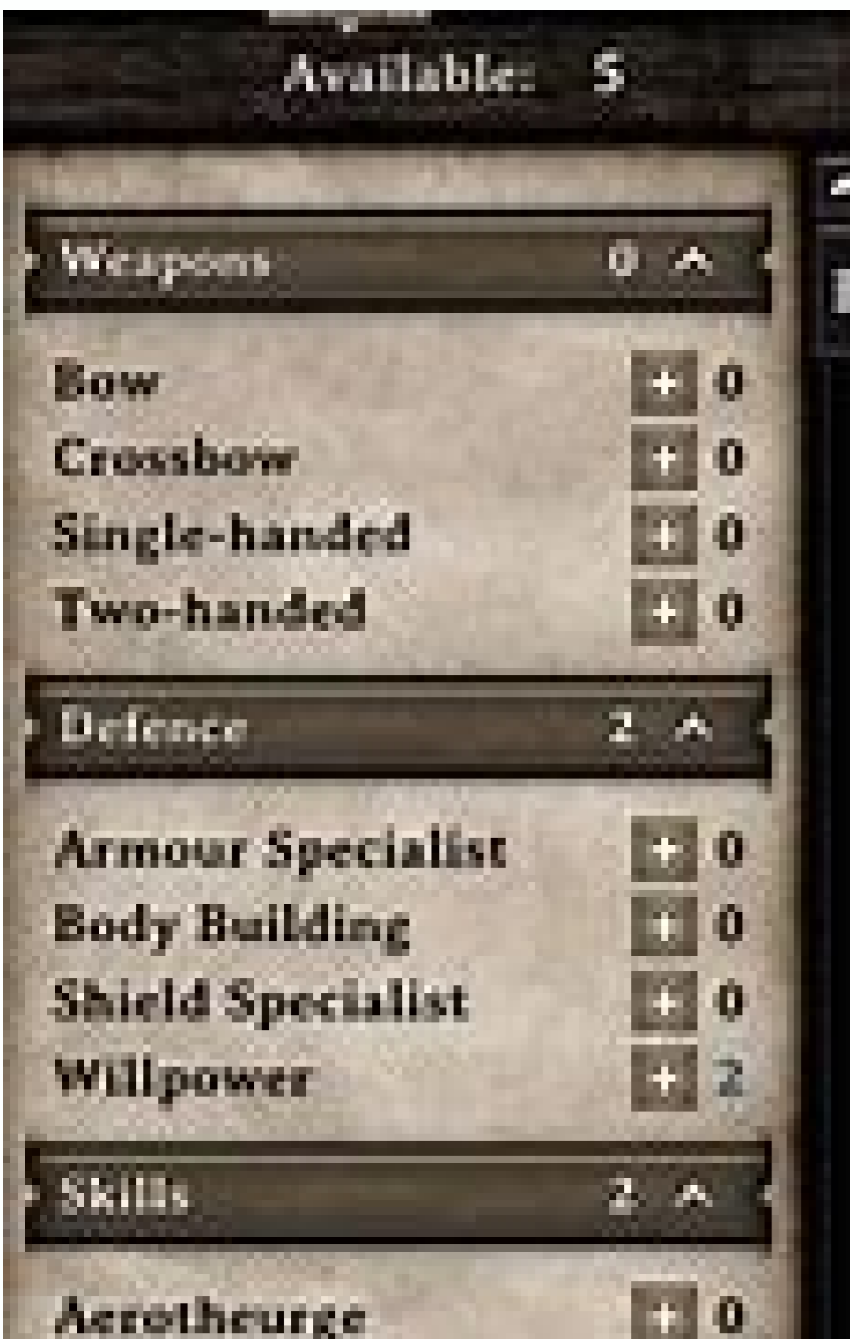
Divinity original sin 2 kill wordless.