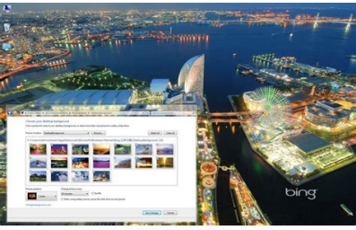
Imagen iso windows 7 professional. Imagen iso windows 7 professional 32 bits. Download windows 7 professional iso image (32 & 64-bit). Descargar imagen iso de windows 7 profesional 64 bits en español. Dell oem windows 7 professional iso image. Imagen iso windows 7 professional 64 bits. Baixar imagem iso do windows 7 professional 32 bits portugueses. Descarregar imagem iso de windows 7 professional 64 bits gratis.