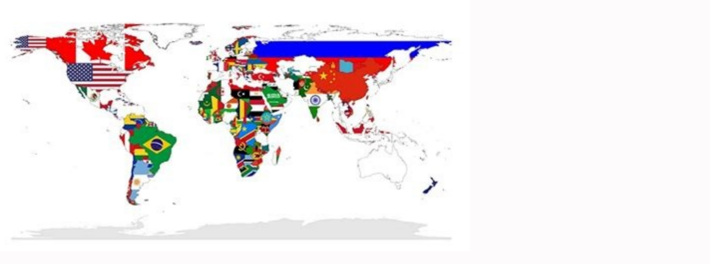
Top 30 largest countries in the world by population. Most big country in world. What is the top 10 largest countries. Most largest area country in the world. Most bigger country in the world.